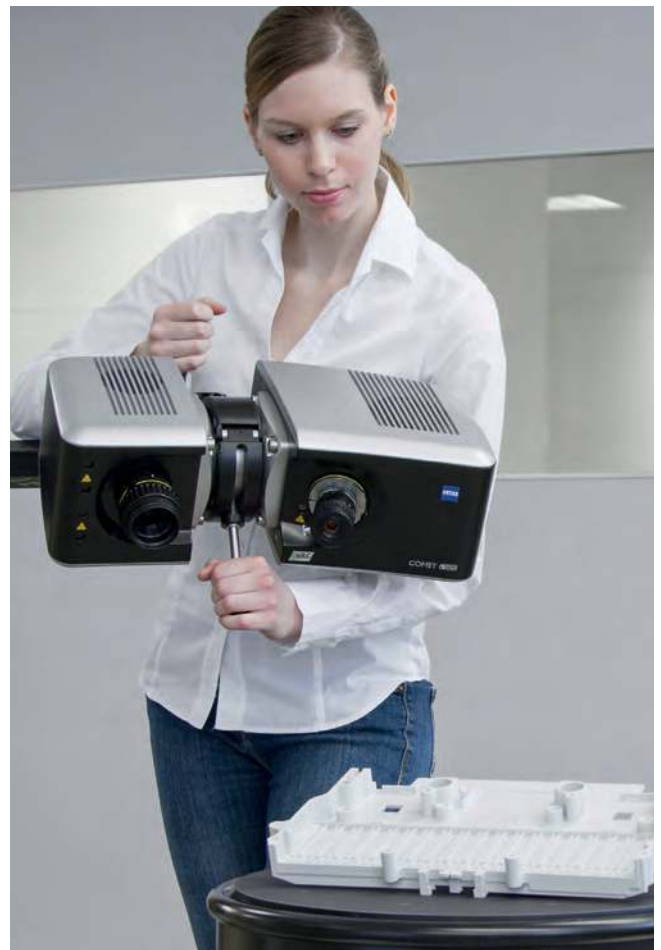
With the user-friendly handling unit, the ZEISS COMET 6 sensor can be positioned very easily and quickly

Requiring only a few simple steps, the modular digitizing system can be adapted to a different field-of view, and is available for your next application within shortest time. Without the need of any elaborate hardware modifications or additional sensors, you can take full advantage of the exceptionally high flexibility provided by the ZEISS COMET 6 high-end sensors.