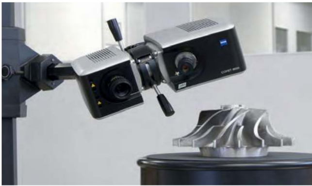
ZEISS COMET 6 provides high-end technology and achieves best results for demanding measurement applications

The high-performance software platform colin3D ensures a consistently efficient and project-oriented procedure during the entire measuring process.